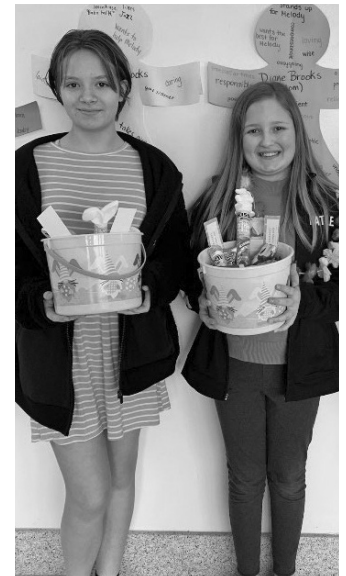
The National Junior Honor Society raised and donated $155 for the Leukemia and Lymphoma Society.