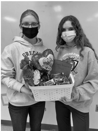
High School Interact members performed “Good Deeds” for the support staff this year by recognizing Administrative Professionals and those who work in Transportation, Custodial and in the Cafeteria.