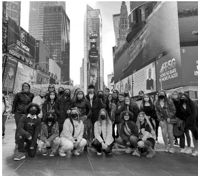
The High School Foreign Language Students went to NYC to see The Phantom of the Opera in February!